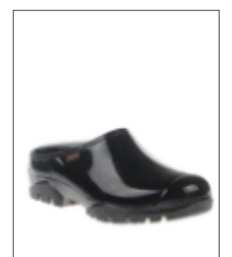
CODE: VBBGPCLG Black/Black