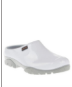
CODE: VWG25CLG White/Grey