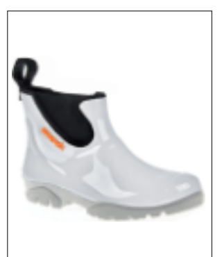
CODE: VWG25C White/Grey