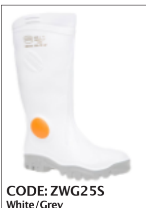
White/Grey Steel Toe Cap