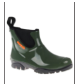
CODE: VGBGPF Green/Grey