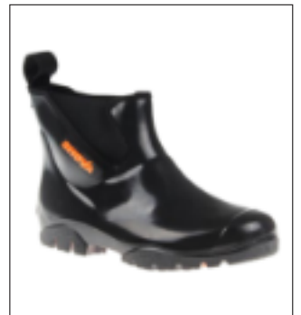
CODE: VBBGPC Black/Black