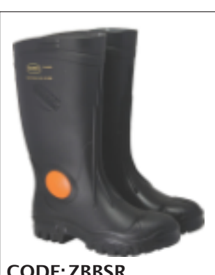
CODE: ZBBSR Black/Black Steel Toe Cap