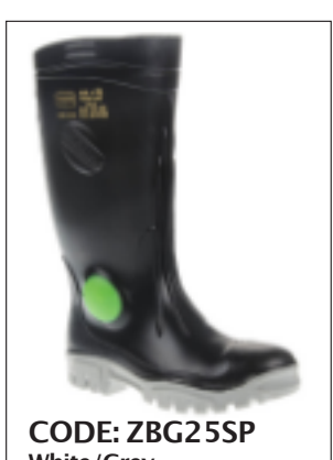
White/Grey Steel Toe Cap