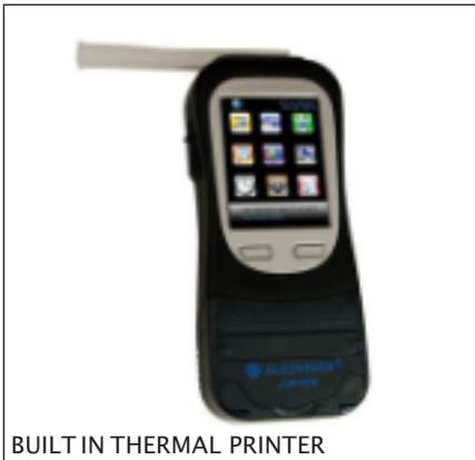
BUILT IN THERMAL PRINTER