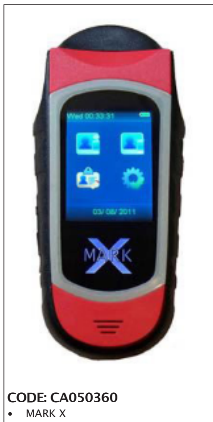
CODE: CA050360 • MARK X