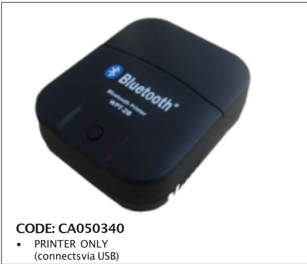
CODE: CA050340 • PRINTER ONLY (connects via USB)